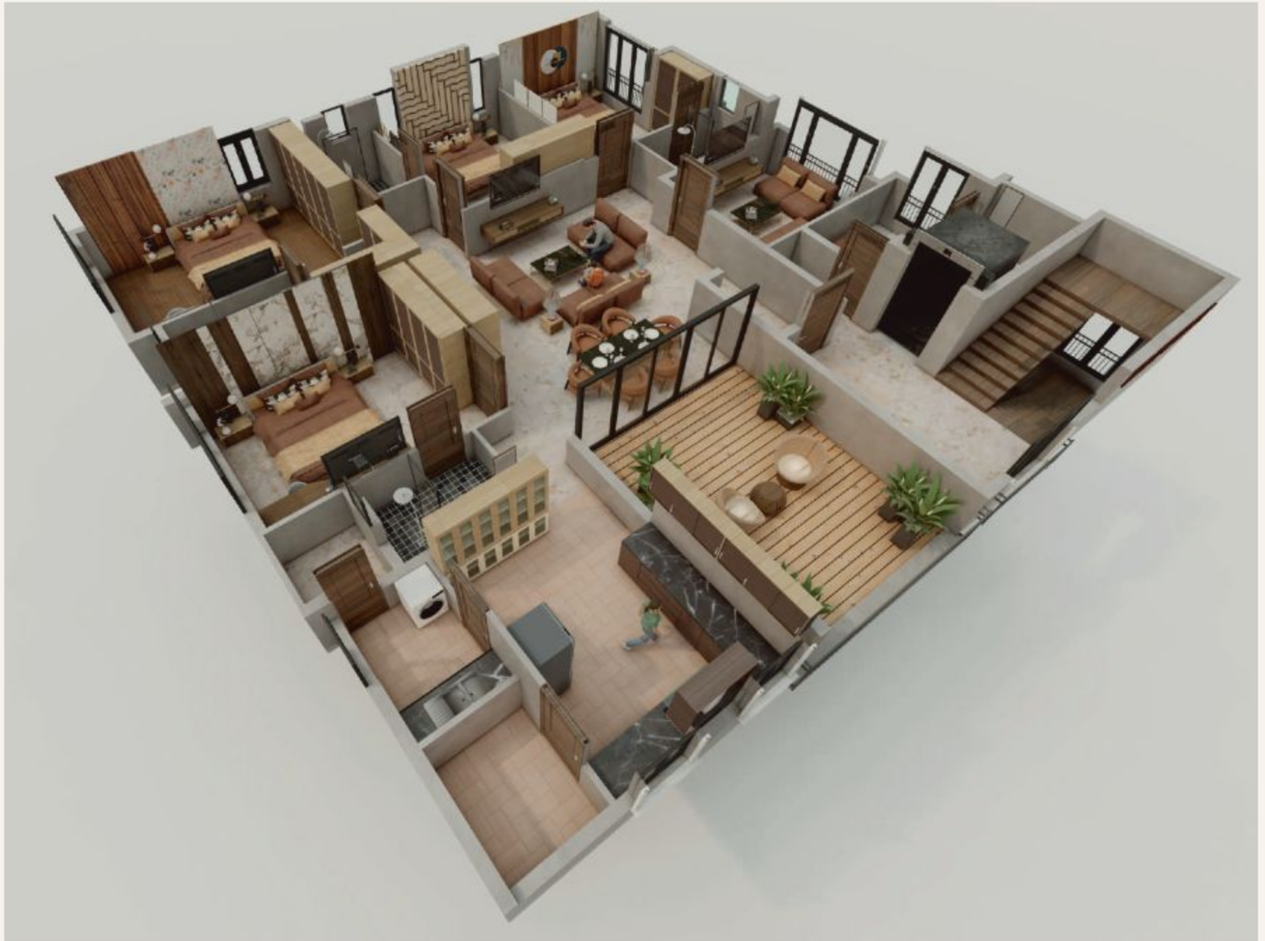
TYPICAL FLOOR PLANS 5TH FLOOR ISOMETRIC VIEW