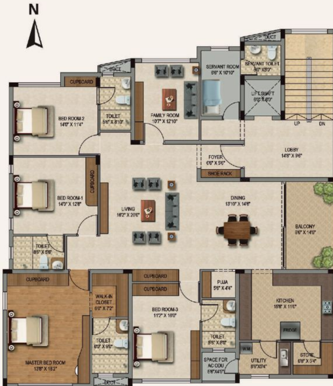
Typical Floor Plans ( 1st to 4th Floors )