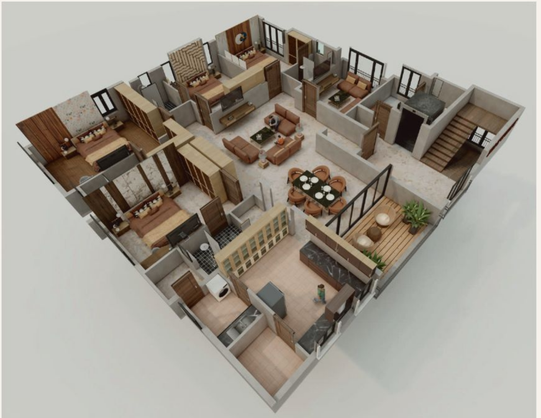
TYPICAL FLOOR PLANS (1ST TO 4TH FLOORS) ISOMETRIC VIEW