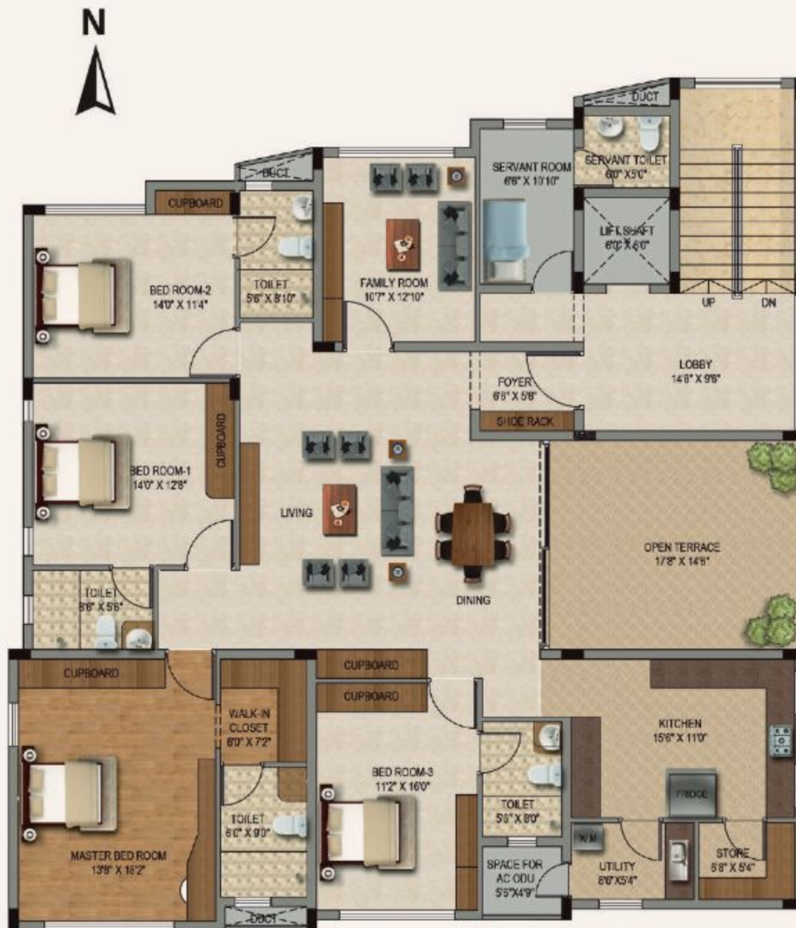
FIFTH FLOOR PLAN